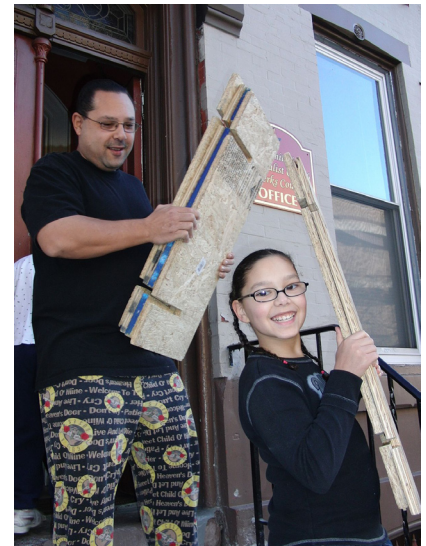
Scenes from Family Promise